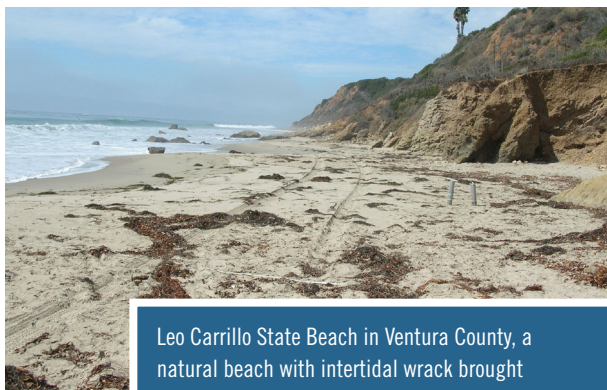
Leo Carrillo State Beach in Ventura County, a natural beach with intertidal wrack brought ashore by waves and tides. Jenifer Dugan