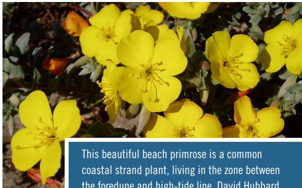
This beautiful beach primrose is a common coastal strand plant, living in the zone between the foredune and high-tide line. David Hubbard